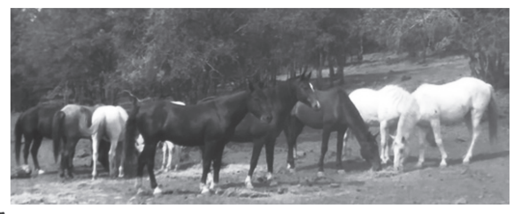
A happy ending for our 10 new arrivals!

For me, looking out my windows to see the horses eating peacefully or frolicking playfully, knowing they're safe in the beauty of their natural environment, helps keep me positive. My heart's desire is for you to be comforted in the knowledge that, because of your help, this haven of nature_ and the wild horses who live here are safe and well cared for. One way we share the beauty of the wild